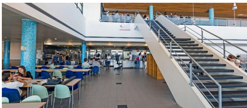
Figure 4. Dining Hall in Alto da Ajuda

You can always bring your own food and use the available microwaves to heat it. We also have one vending machine near the Small Animal Hospital; two cafeterias in building C (first floor) where you can have a complete meal for a low price; and one dining hall at 8 min walking distance (dining Hall do Alto da Ajuda) where you can eat between 12.00 and 14.30h starting from 2,85 euros. Most of these places allow their customers to choose one of the available dishes. Options vary between meat, fish, diet or "ovo-lacto vegetarian". In addition to these options, you have other dining halls and bars, cafeterias, snack bars and restaurants available to the entire academic community, check them out @ https://www.ulisboa.pt/en/info/dining-halls .