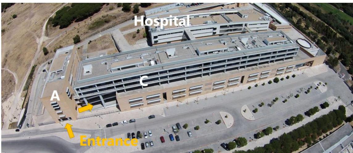
Figure 2. FMV-ULisboa main buildings (A, C, Hospital)

You will always start at the mobility office. After you entrance in the building C, take the first lift to the 3 rd floor; go straight to find on your left, office C3.26. There you will meet Dr a Alexandra Matos, our secretary (Fig 2). She will go