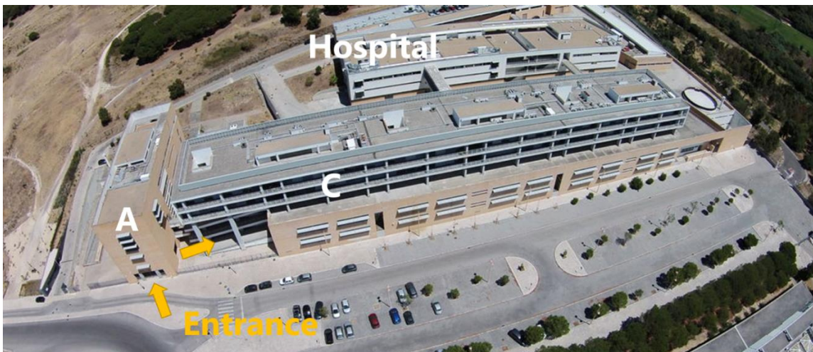
Figure 2. FMV-ULisboa main buildings (A, C, Hospital)

You will always start at the mobility office. After you entrance in the building C, take the first lift to the 3 rd floor; go straight to find on your left, office C3.26. There you will meet Dr a Alexandra Matos, our secretary (Fig 2). She will go