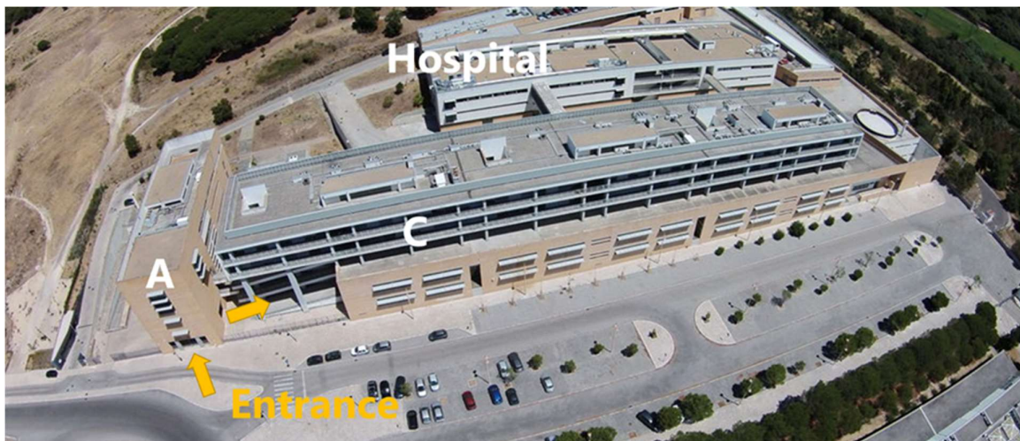
Figure2. FMV-ULisboa main buildings