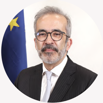
Paulo Rangel Minister of State and Foreign Affairs, Portugal