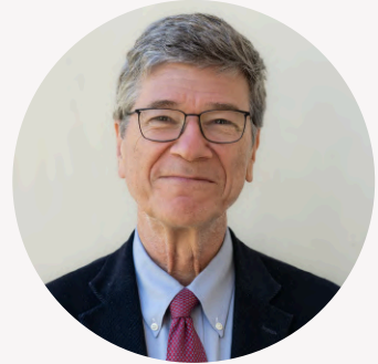
Jeffrey D. Sachs President of the UN Sustainable Development Solutions Network