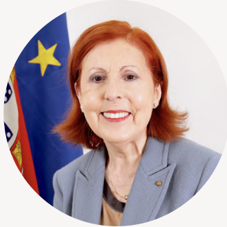
Maria da Graça Carvalho Minister of Environment and Energy, Portugal