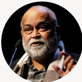
Arjun Appadurai Emeritus Professor of Media, Culture and Communication at New York University